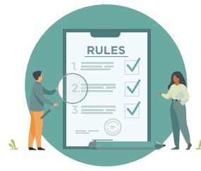
Regulatory and industry changes