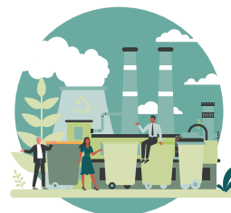
Business, industrial and commercial waste management