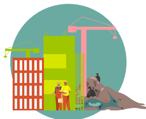
Development encroachment on landfill sites