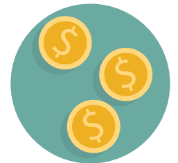
Financing waste management