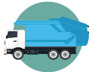
Managing our Landfills