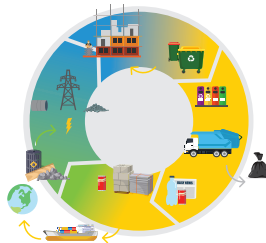
The Circular Economy

We want to understand what issues and aspects of waste management are important to you. Including topics like