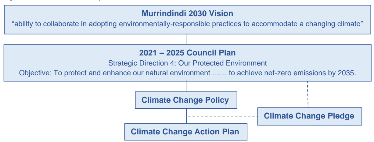
Figure 1: Governance Hierarchy

This document delivers against the 2021/2022 Council Plan Action 4.3.7 'Develop a Climate Change Policy'. It sits within the organisation's governance hierarchy as follows: